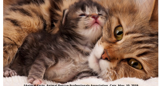
*Animal Facts. Animal Rescue Professionals Association, Cats. May, 10, 2019

In just 7 years, a single pair of cats and their offspring could produce a staggering total of 420,000 kittens.